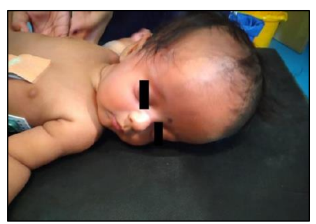
Fig 1: Pre-op Clinical Picture