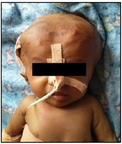
Fig 3: Post-op Clinical Picture